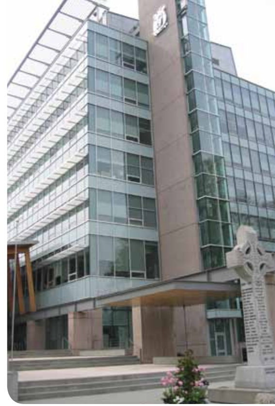
Richmond British Columbia City Hall

Top performers will be recognized and profiled in the spring of 2011.